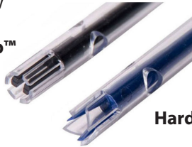
Hard Tissue Omni Tip™

NOTE: Omni Tip™ plastic probes are not factory presterilized or disinfected. If this is a requirement, please use one of the recommended methods described below.