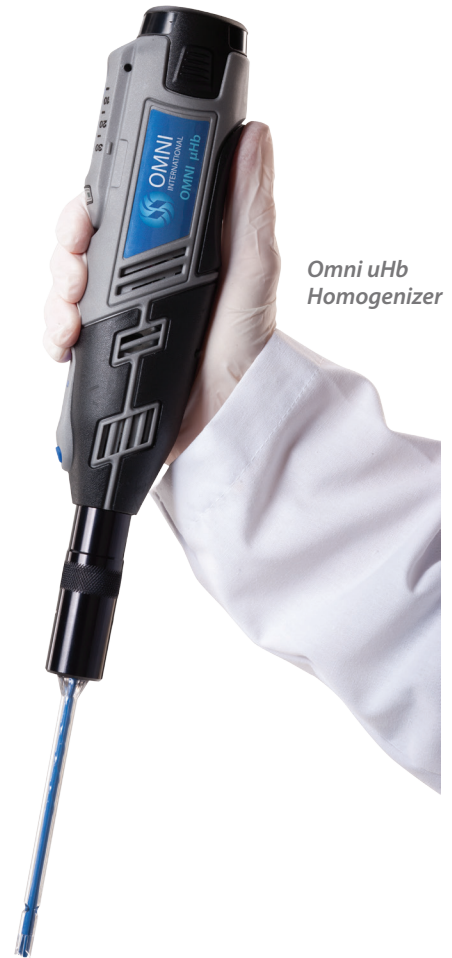
Omni uHb Homogenizer

Omni Tip Disposable Hard Tissue Generator Probes: 30750H